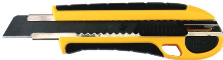
18mm Auto Lock EVO Black Blades